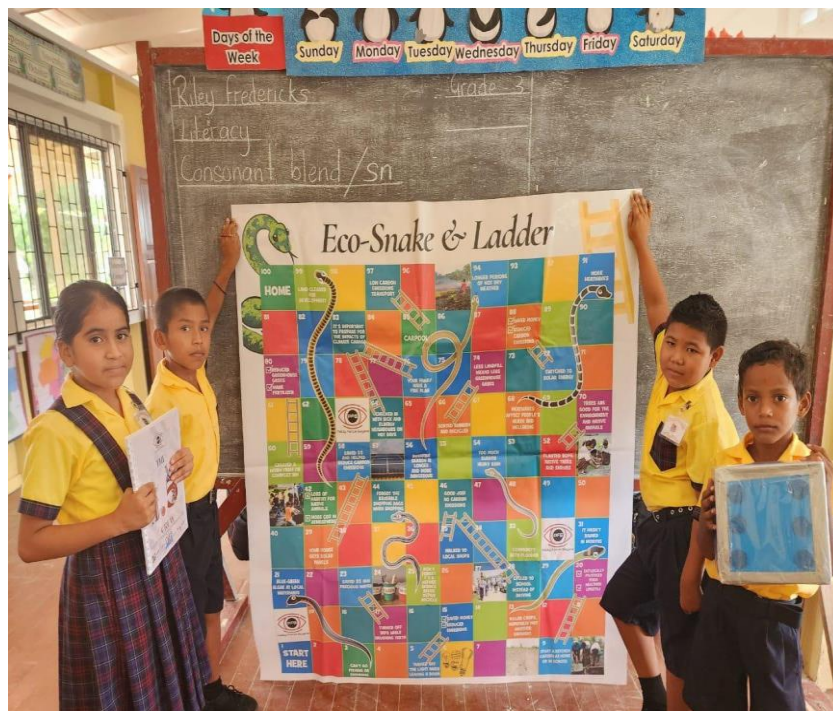
Figure 2: Tapakuma Lake Primary School

NB: Unfortunately, due to circumstances beyond our control, the representative from Santa Rosa Secondary was unable to provide photographic evidence confirming the receipt of the 1.5 Crew training kit.