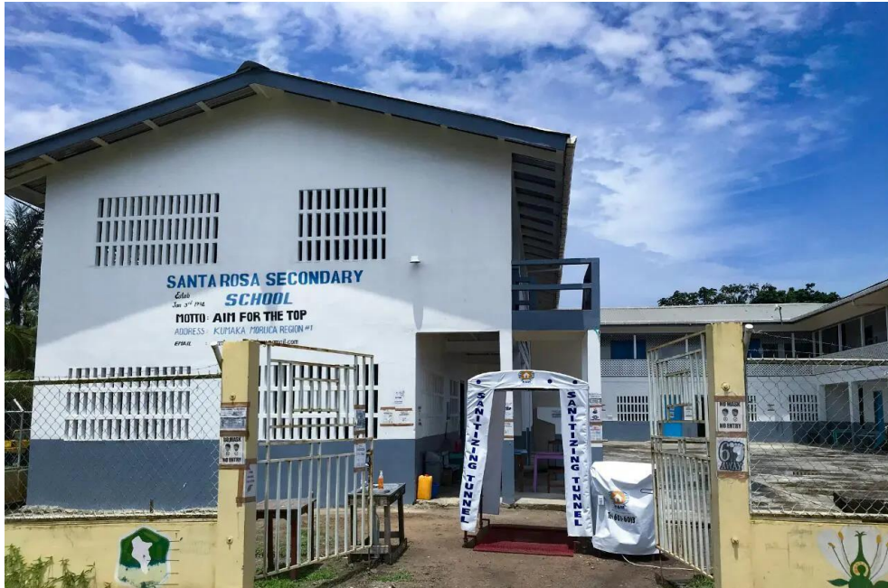
Figure 1: Santa Rosa Secondary School

NB: Unfortunately, due to circumstances beyond our control, the representative from Santa Rosa Secondary was unable to provide photographic evidence confirming the receipt of the 1.5 Crew training kit.