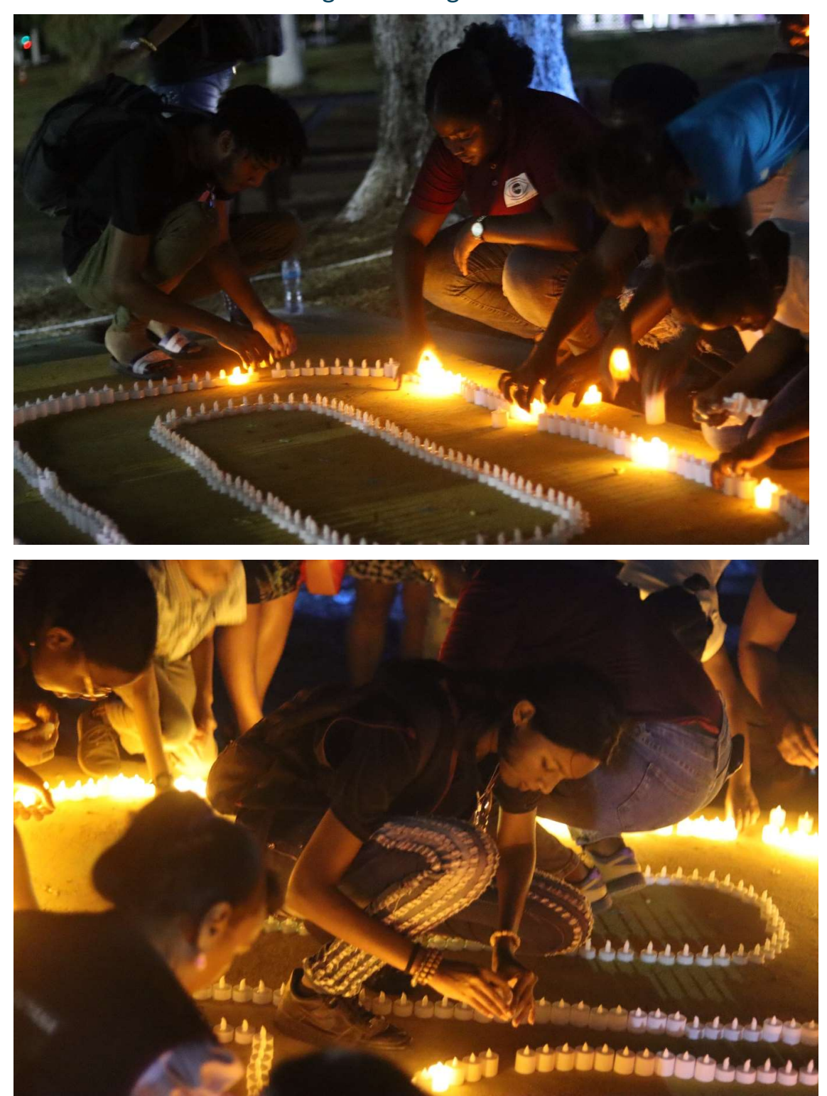
vi. Scenes from the Lights Off Segment